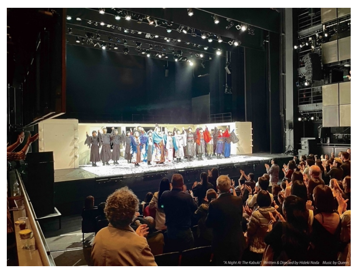
Loyal Queen fans will be impressed! The play features all 12 songs from their iconic album and live recordings officially approved by the band.

For overseas viewers, subtitles in English, Chinese (CT), and Japanese will be available on Stagecrowd, a streaming platform by Sony Music Solutions.